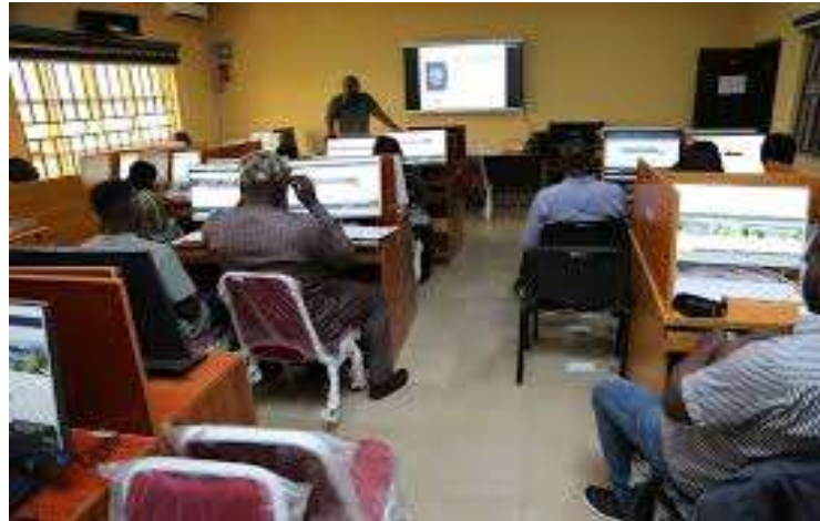
Ensuring maximum use of Information Resources through periodic Training and Workshop