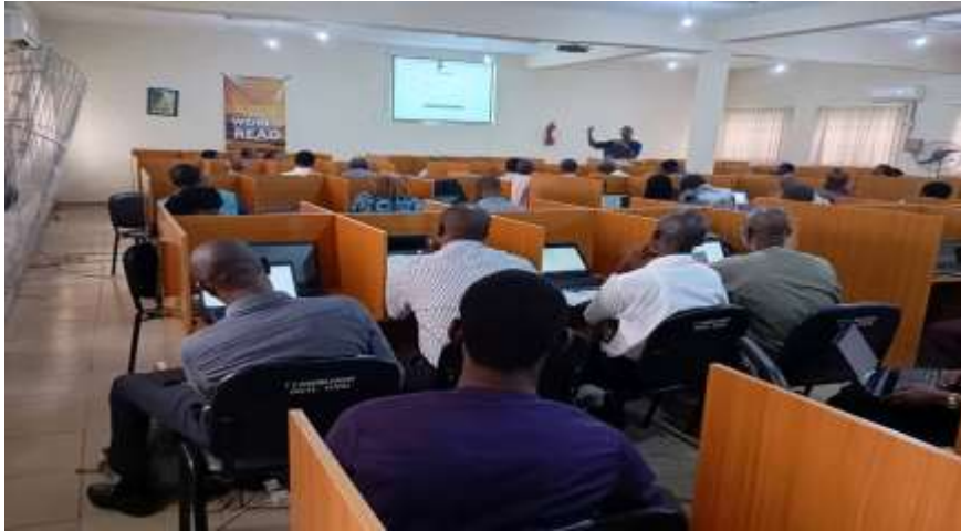
Teaching, Learning, and Research Supports